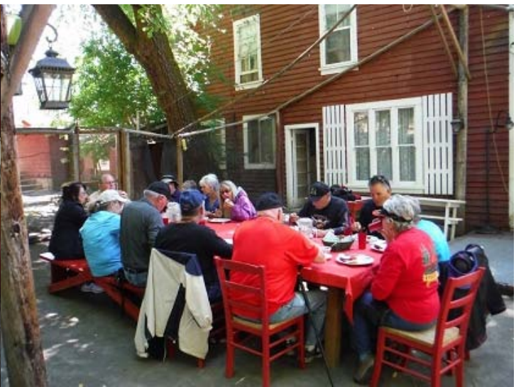
Farm House Lunch