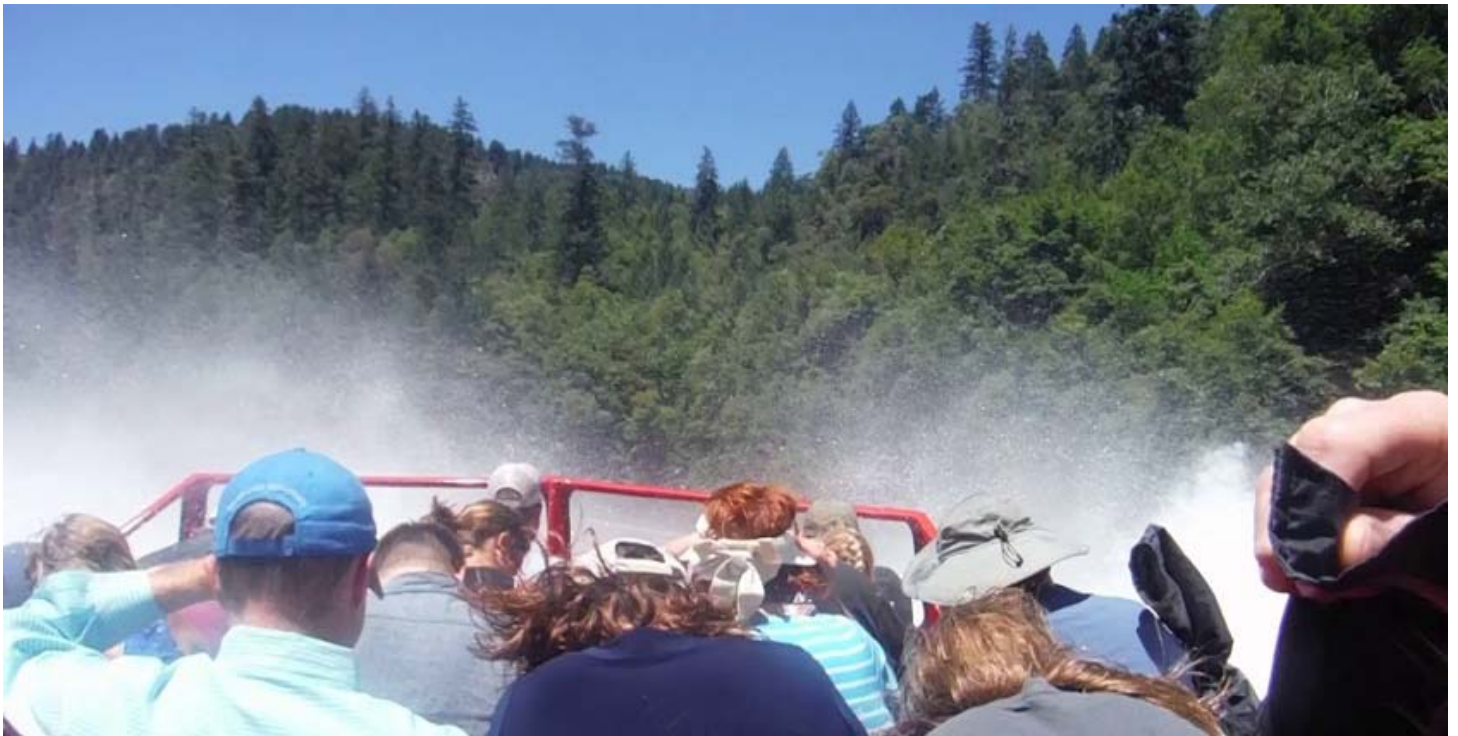
The "Spin around"