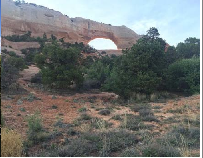
Arches National Monument