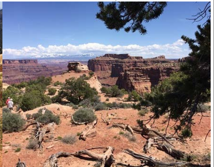
Dead Horse Valley