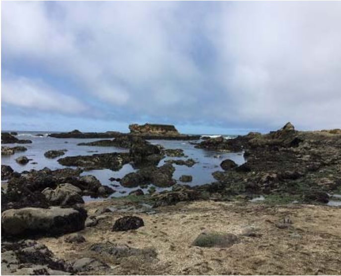
Glass Beach, CA