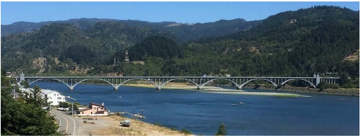
Deco style bridge built in 1932