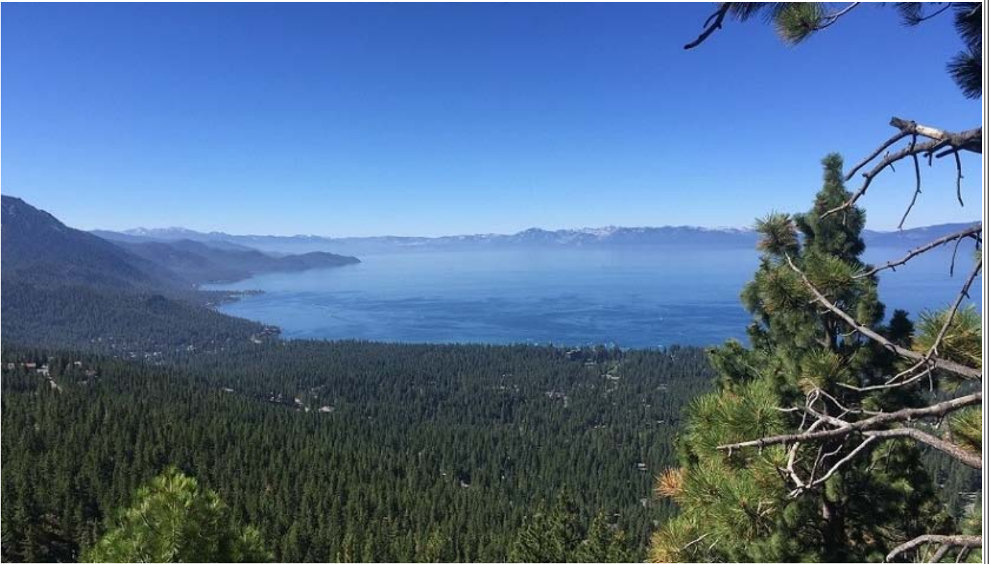
Lake Tahoe as seen from Mt. Rose