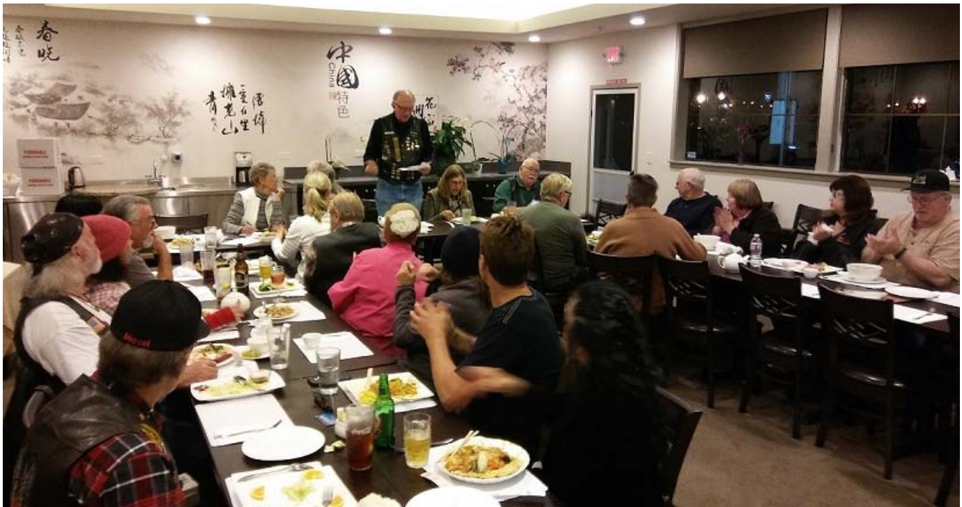
General Meeting and Election night, November 15, 2016 - China Village, Cotati