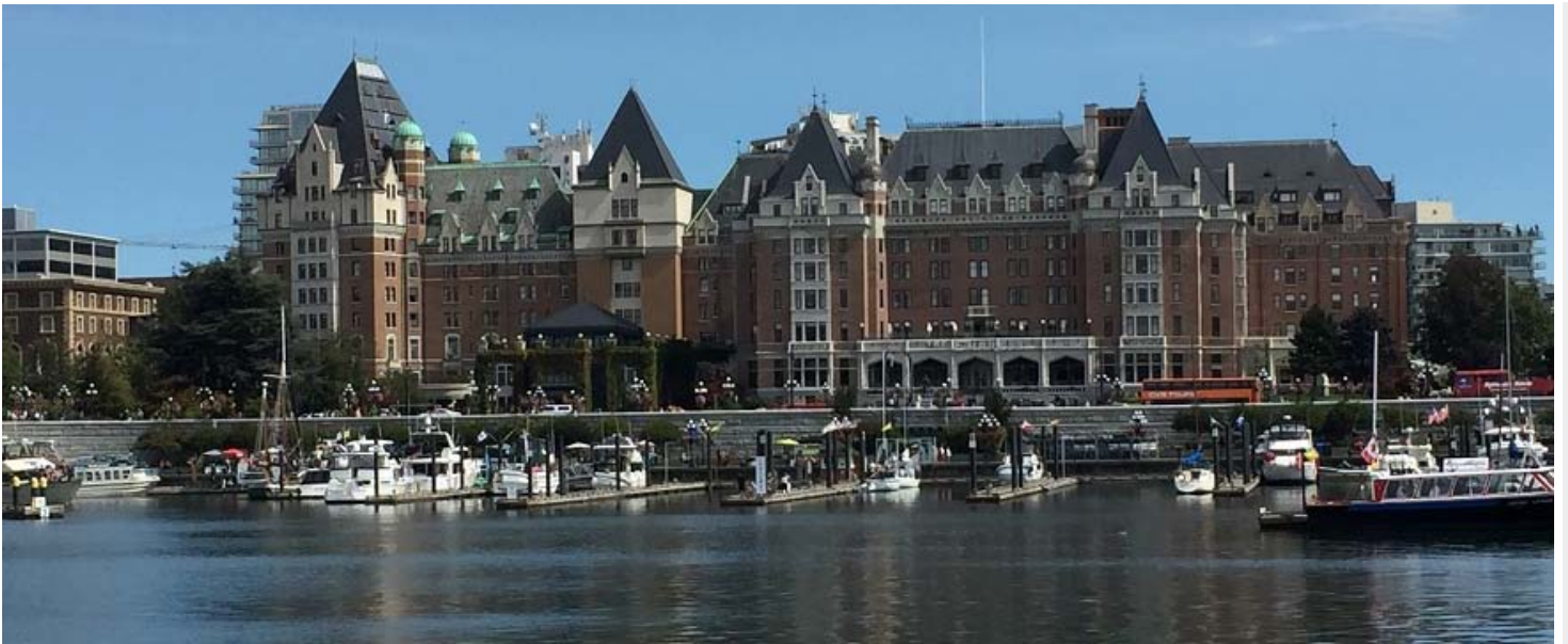
World famous Empress Hotel