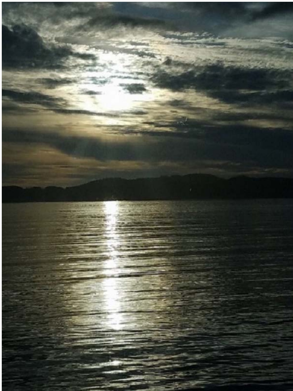
Victoria, Vancouver Island