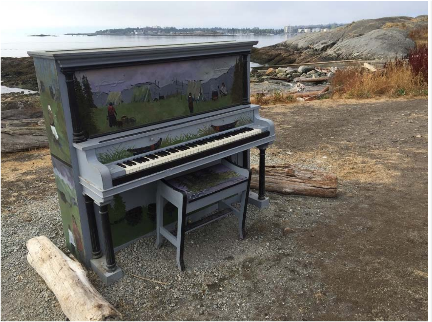
Gold Beach, Oregon on the way home