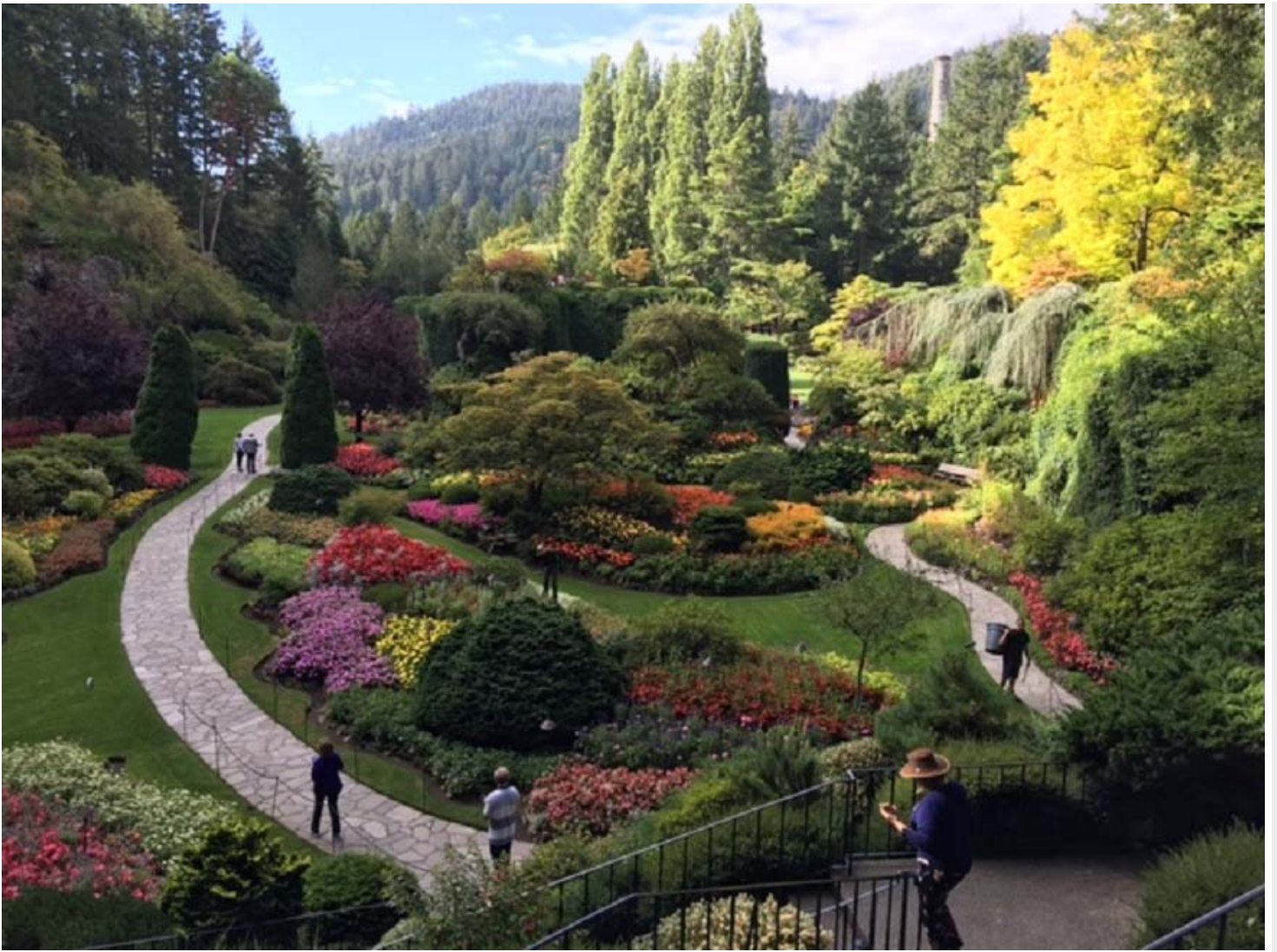
Native Totem poles