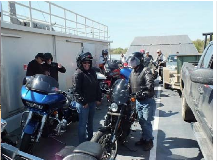
The First Ferry