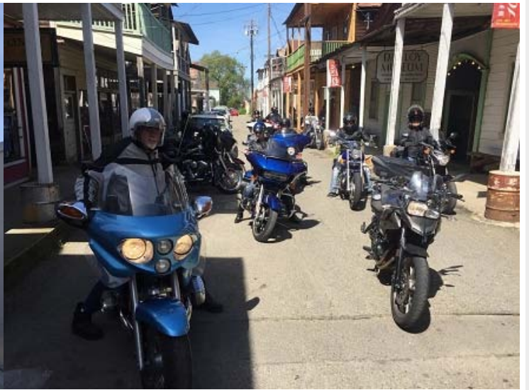
Lunch at the historic town of Locke