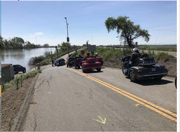
Waiting for the next Ferry