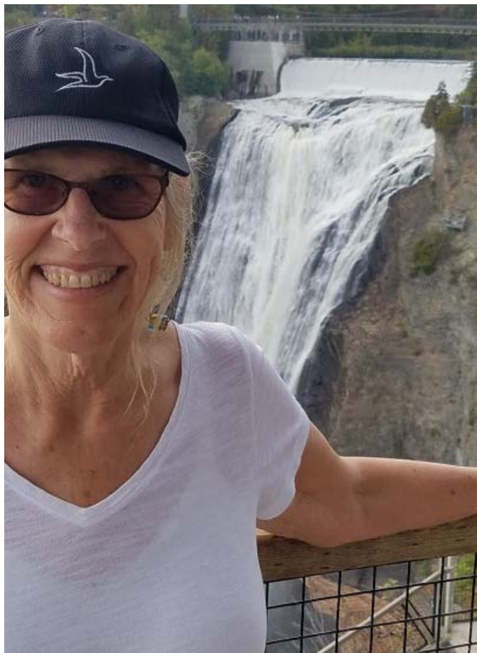
My lovely wife at the falls

Oh yea, the leaves are starting to turn as well. The farther east we go the more we see them.