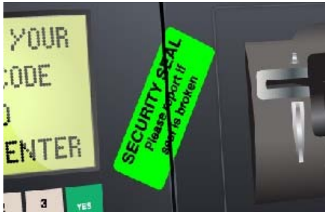
Pump security seal

3. Don't use a debit card where you must use a pin number, use it as a credit card instead.