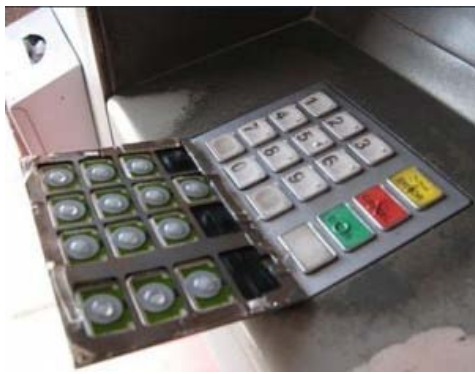
Key pad overlay