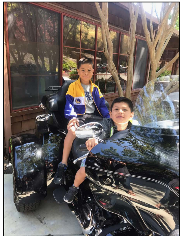
Father's Day BBQ @ Brookdale Assisted Living Center