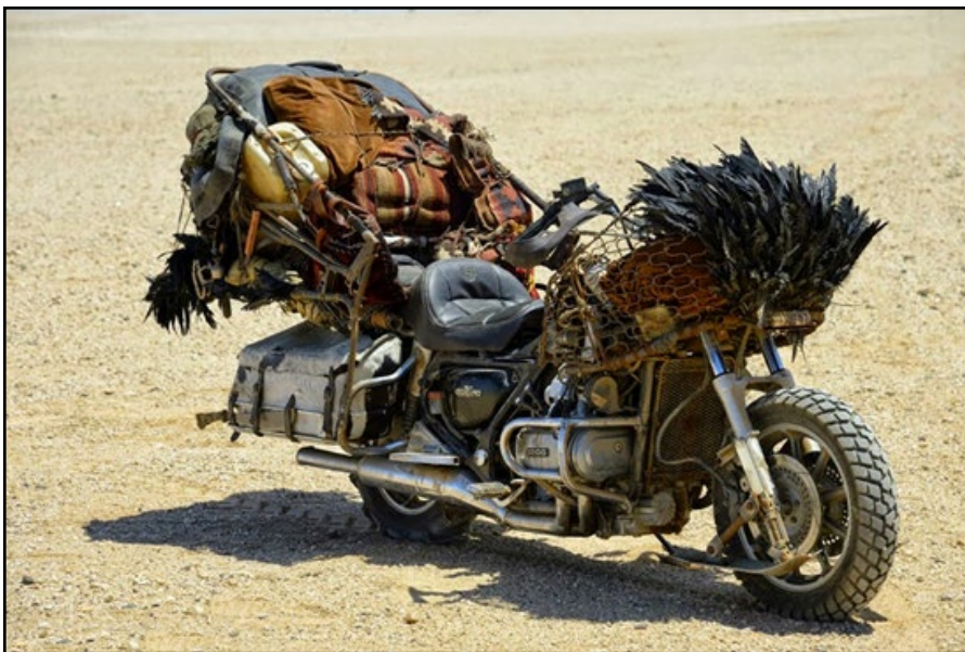
Some Modifications May Go Too Far

DO-DADS: When I first entered my second childhood, I was interested in adding bits of chrome here and there to make my ride unique. I have pretty much outgrown this modification, but I do admire things others have done in this category, so I still consider modifications of this type from time to time.