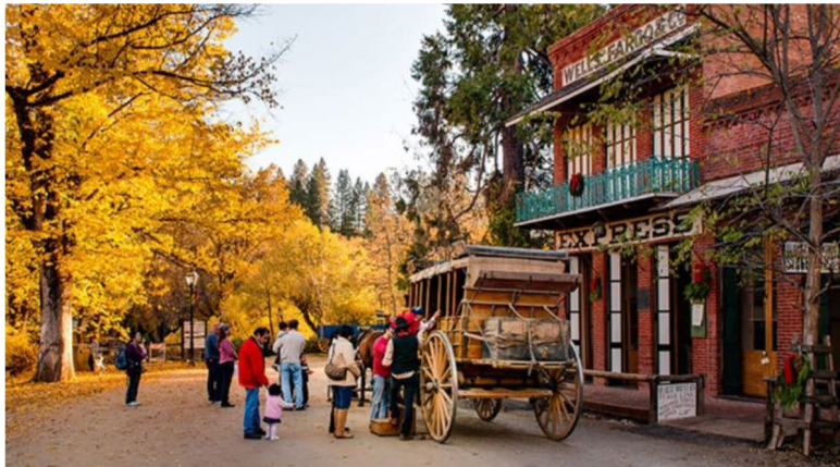
Columbia State Park

After lunch it is a short ride to the gold rush town of Columbia, where you will have an hour or so to explore and play biker tourist.