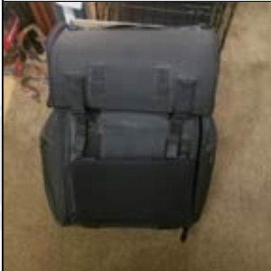
Saddlemen Hard Case Travel Bag - $75

We have a few items left over from the After Holiday Party Silent Auction. These items are in great condition and can be yours for a song (and a few bucks). The prices listed are suggested purchase prices but reasonable offers will be considered. Contact Melisa at 707.246.3520. Remember ALL proceeds will go to our charity Ceres!