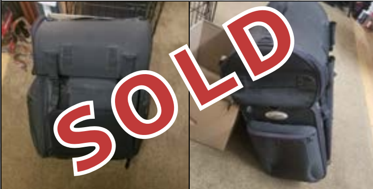
Saddlemen Hard Case Travel Bag - $75