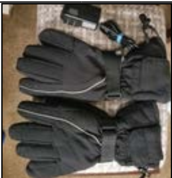
Heated Gloves w/re-chargeable batteries - $50