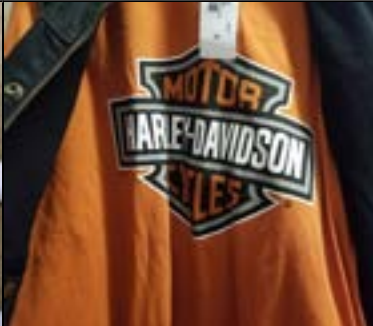
Harley Davidson Long Sleeve Shirt (XL) - $10