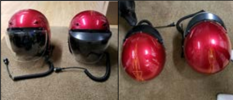
2 HJC helmets (XL and M) w/blue tooth between helmets - $200