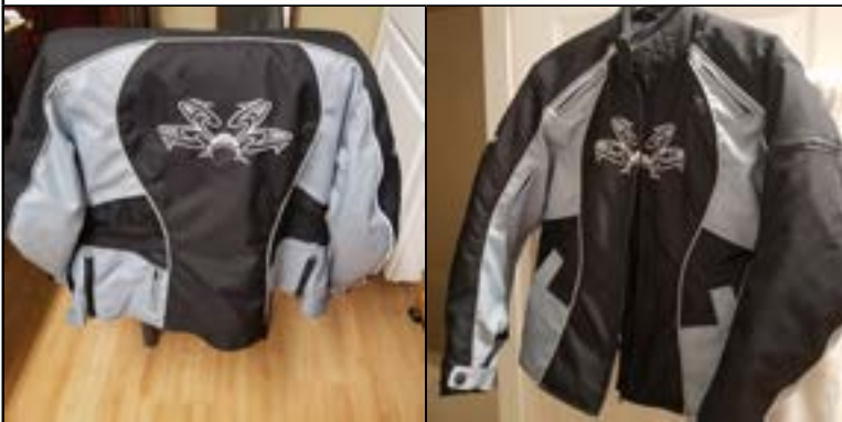
Lady Ryder Jacket (Small) - $75

We have 10 double queen rooms reserved at the Topaz Lodge and Casino. The rooms are booked under "redwoodriders" @ $134.47. We tentatively held rooms on the second floor which is actually street level but folks should mention this when the book if they don't want to deal with stairs. Call 1-800-962-0732 for reservations. Free cancellation 3 days prior to check-in.